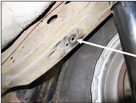
Figure 5 – Left side factory hanger holes

Enlarge these two holes to 3/8" diameter.