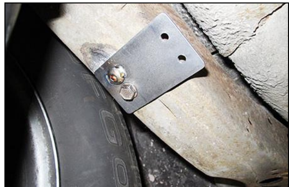
Figure 8 – Right tailpipe hanger bracket