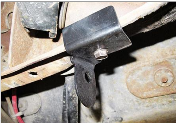
Figure 1 – Left over-axle hanger bracket