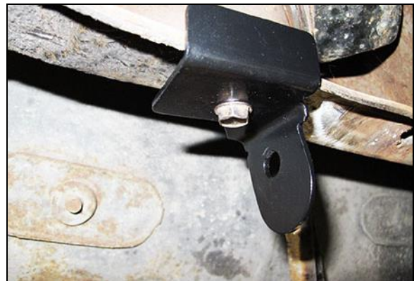
Figure 2 – Right over-axle hanger bracket