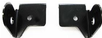
Left Right Front over-axle hangers