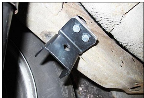
Figure 10 – Right tailpipe hanger bracket