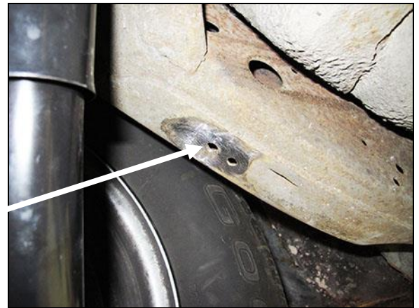
Figure 6 – Right factory hanger holes

Enlarge these two holes to 3/8" diameter.