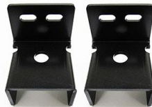
Rear tailpipe hanger (left and right)